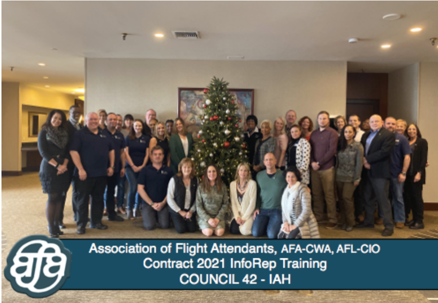
See additional InfoRep Training Photos at contract2021.org

As part of the preparation process for our 2021 Contract, Support Activist InfoRep trainings have been taking place across the system.